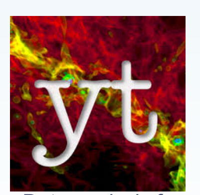
Data analysis for large scale simulation data