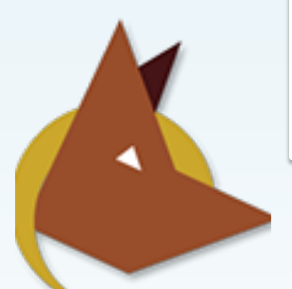
Browndog: Curation for "long tail" unstructured data